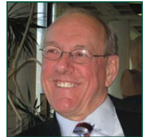
Syracuse University men's hoop coach and Hall-of-Famer Jim Boenheim delivered the 2007 Carl and Fanny Fribolin Lecture.

And, if you're a musician looking for a place to play, consider joining the Keuka College Symphonic Band. Or, if you're a vocalist, there's the Keuka College Chorale. Both groups feature students and community residents.